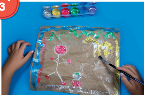
Paint your cave painting.