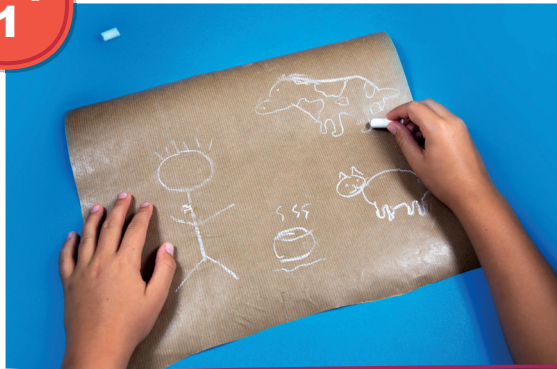
Draw over the brown paper with chalk.