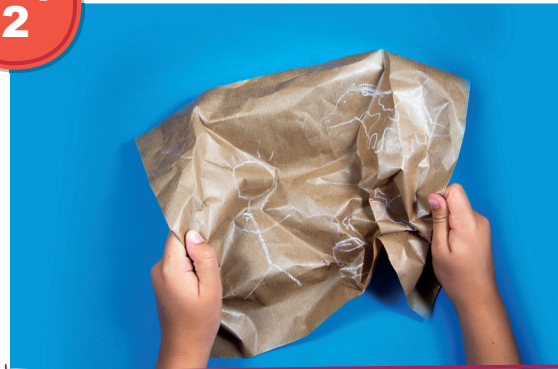
Tear the paper to make it look old.