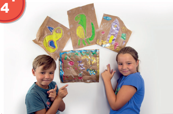
Add your cave painting to the class display.